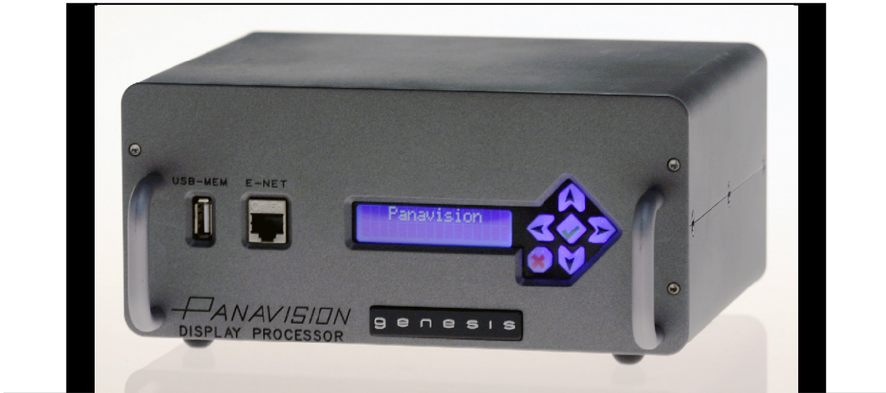
Genesis Display Processor